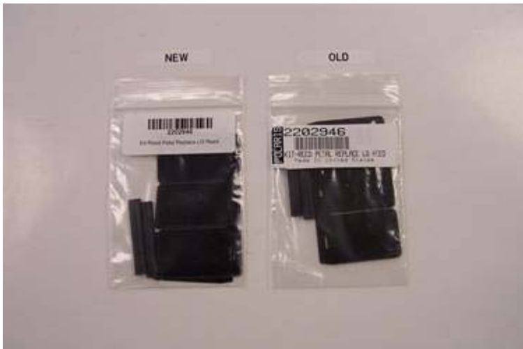
New Reed Petal packaging vs. old.

To replace the reed petals, separate the reed cage from the outer housing, Use a small flat blade screwdriver to drive the center petal retainers outward. Use pliers to pull the petal retainers out of the reed cage and discard. Install the new reed petals, and petal retainers supplied in the kit.