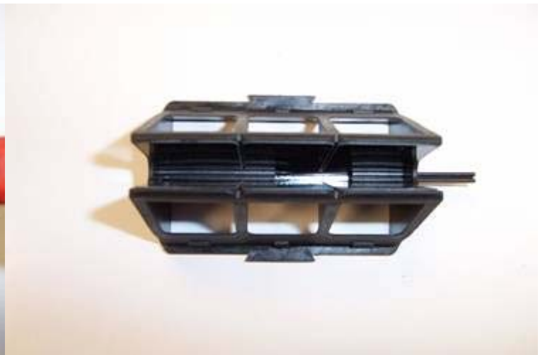
Inserting a new reed petal.