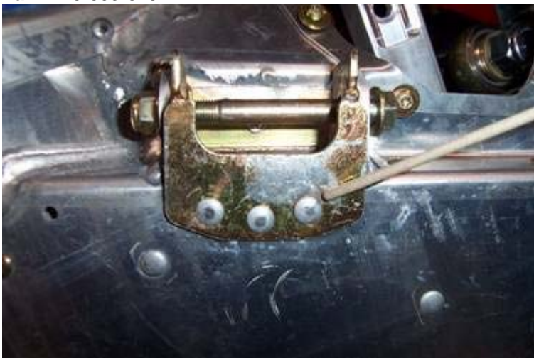
Check condition of the rivets on control arm mounting brackets.

Cost for the kit P/N PR102 is $10.00. To order contact Polaris Race Dept. Parts Support. Dennis Weinke Ph.# 715-355-3008 Fax# 715-355-8797