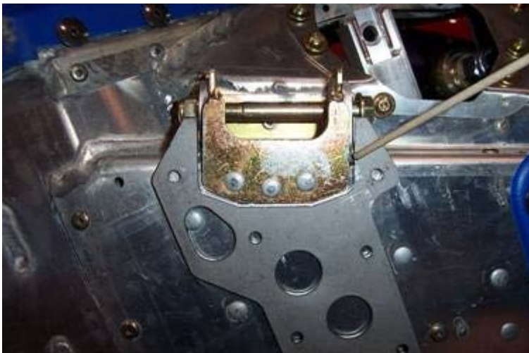
Weld each end of the support strap to the steel lower control arm mounting brackets